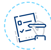
Pre-Event Planning and Support