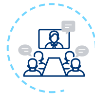
Interactive Virtual Event Platform