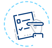
Pre-Event Planning and Support