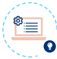
Market-driven Program Development