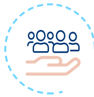
Experienced Event Support Team