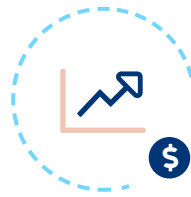
Customized Sponsorship Sales Opportunities