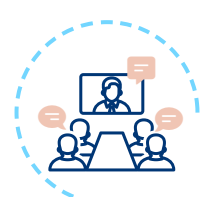
Interactive Virtual Event Platform

A great opportunity to get to work with seasoned trade compliance professionals in an in-depth discussion of very complex trade compliance subjects with the upcoming generation of trade compliance leaders. The presentations were challenging and the very thought-provoking questions from the audience were even more so.