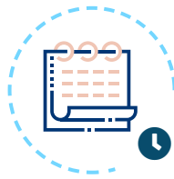
Dedicated Event Logistics