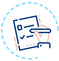
Meticulous Event Planning and Support

Your front-line event team will be supported by a host of C5 employees to contribute to the success of your event. Their responsibilities span market research and programming, marketing, sponsorship and exhibition sales and execution, meeting planning and logistics, delegate sales, customer service, data analytics, graphic design, web design, speaker coordination and attendee engagement.