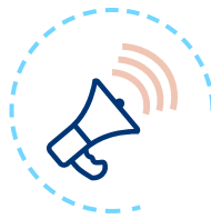
Tried and Tested Marketing Campaign